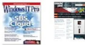
Windows IT Pro Connected Planet

Welcome to MobileDevPro , a new resource brought to you from the familiar editors and authors of the Windows IT Pro family of publications and our Penton Media colleagues at Connected Planet Online , which covers the telecom and wireless industries.